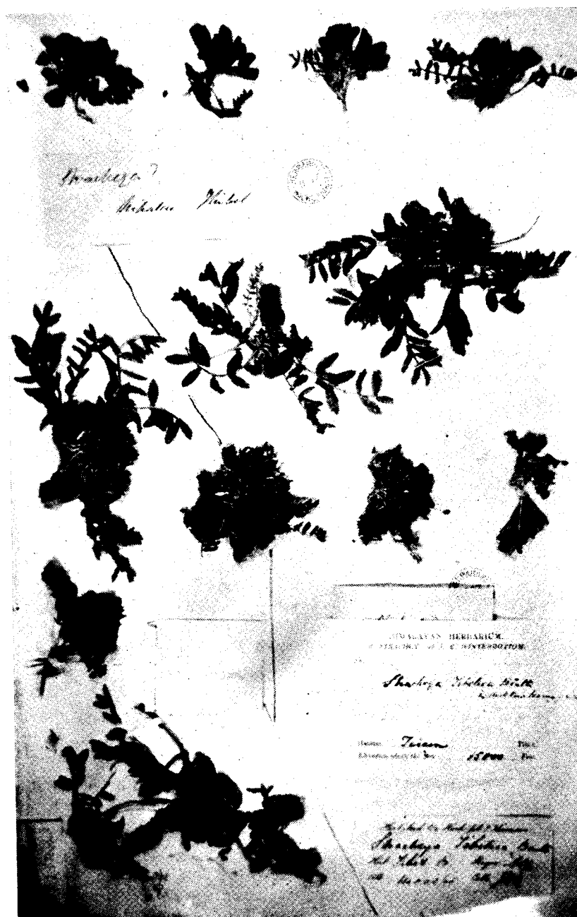
Fig. 1. Stracheya tibetica . Photograph of type specimens (K).