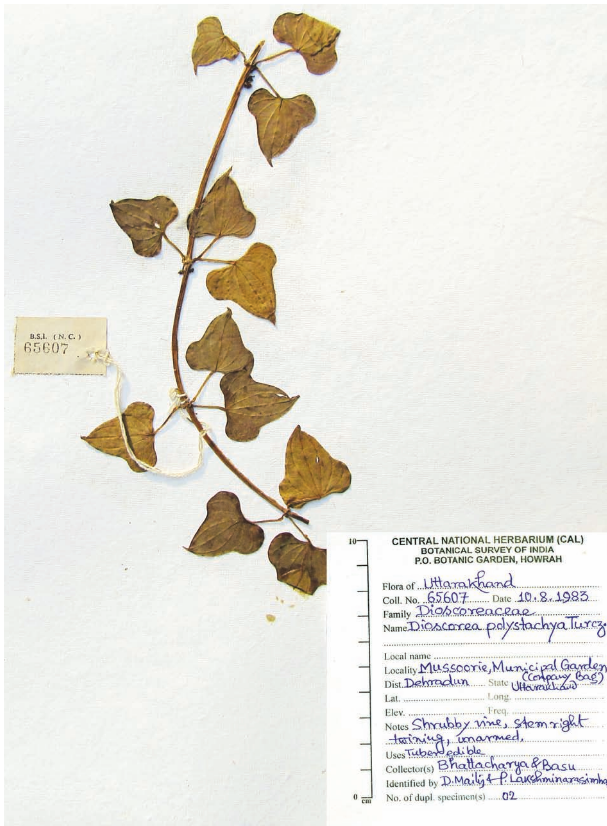
Fig. 2. Dioscorea polystachya Turcz. (Bhattacharya & Basu 65607, CAL).