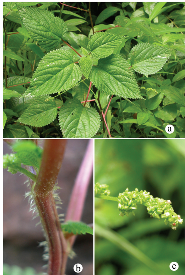
Fig. 2. Laportea interrupta (L.) Chew: a. Habit; b. Stinging hairs on the stem; c. Inflorescence.

Small annual herb, c. 60 cm high. Stem woody at base with few branches, greenish-brown, deeply furrowed with stinging hairs towards apex. Leaves simple, alternate, ovate to broadly ovate, 4–7 ×