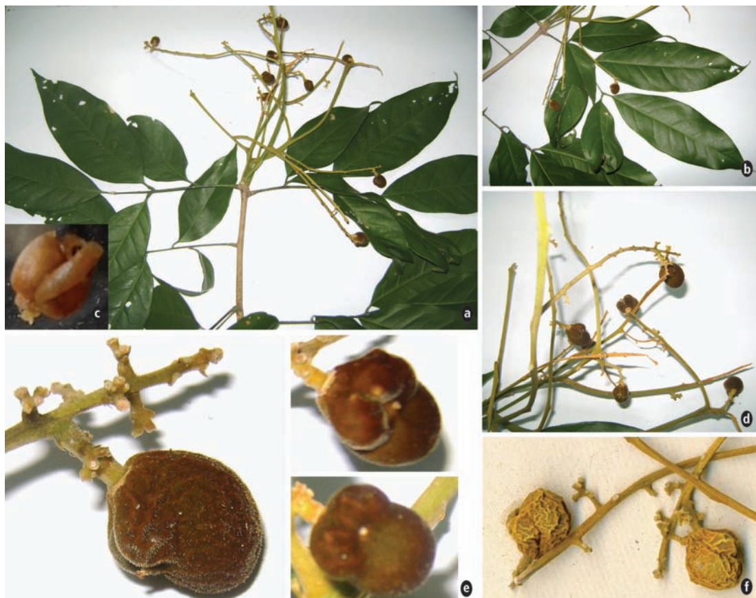
Fig. 2. Lepisanthes ferruginea (Radlk.) Leenh.: a. Fruiting-branch; b. Leaf; c. Flower (spirited); d. Fruits; e. Single fruit (young) enlarged; f. Dried fruit (young).