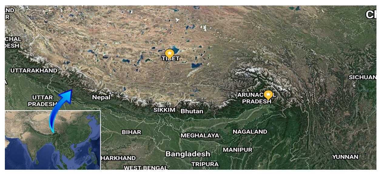
Fig. 3. Distribution of Lysionotus gamosepalus W.T. Wang.