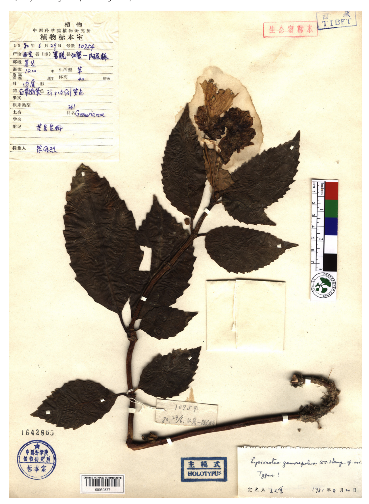
Fig. 2. Type of Lysionotus gamosepalus W.T.Wang (PE00030827).