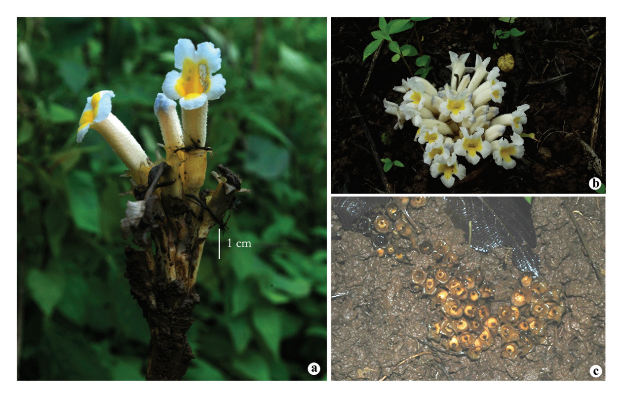
Fig. 2. Christisonia calcarata a. uprooted individual; b. Inflorescence; c. Infructescence.

Thane (Bombay) and that of Dalzell's from Salsette and the latter has been identified as C. stocksii by Dalzell himself (Kew has tagged the same sheet with two different numbers K000821671 might be for Dalzell's specimen and K000821672 for Law's