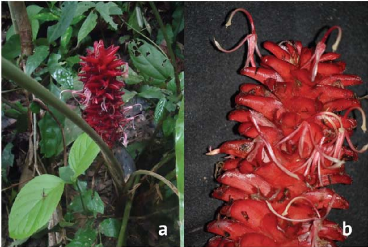
Fig. 1. Larsenianthus arunachalensis M. Sabu, Sanoj & Rajesh Kumar: a. Habit & inflorescence terminal on a leafy shoot; b. Close up view of inflorescence with flowers.

flowering shoot, reddish green, densely pubescent towards apex; petiole 20–25 cm long, pubescent, green; ligule c. 6 cm long, c. 1 cm wide, lanceolate, apex attenuate, pubescent abaxially; blade 35–75 × 11–18 cm, abaxially pale green and densely pubescent with silvery hairs, elliptic-oblong, dark green, glabrous above. Inflorescence terminal, erect up to 90 cm long; apical part of peduncle 25–55 cm long, pubescent, pale green; spike elliptic, c. 18 × 4 cm; bracts 2.7–3 × 2.6–2.7 cm, imbricate, orbicular to broadly elliptic, deep red, base white tinged, both surfaces pubescent. Flowers conspicuous, 2–4 per bract; calyx tubular, 16–17 × c. 3 mm, apex trilobed, unilaterally split, 5–6 mm long, pale red, white towards base, pubescent, densely hairy at apex, membranous; floral tube 3.2–3.3 cm long, c. 3.5 mm wide at opening, red, lobed with each lobe 15–17 mm long, oblanceolate, dorsal lobe reflexed, sparsely pubescent externally with scattered unicellular branched hairs inside, lateral lobes glabrous; lateral staminodes c. 4 × 3.5 mm, orbicular to broadly elliptic, white with pale red tinge, revolute; labellum 25–28 × 2.5–3 mm, semi-spathulate, red to pale red towards base, beak-like apex. Fertile stamen with filament 2.4–2.6 cm long, red becoming creamy-yellow near anther, arching;